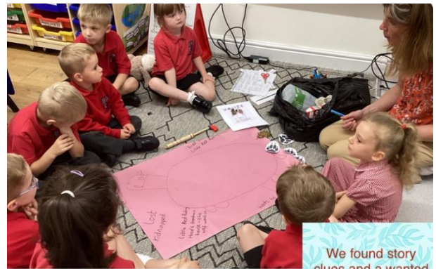
We found story clues and a wanted poster for the wolf and thought about why he was wanted and talked about the story clues. 11.9.23.

In class 1 they are reading the Lost Wolf. The children started the unit with clues about the story and have consolidated their learning in the story role play area. They are working hard to construct sentences and using a range of adjectives to improve their descriptions. The children are working so hard and we are very proud of them.