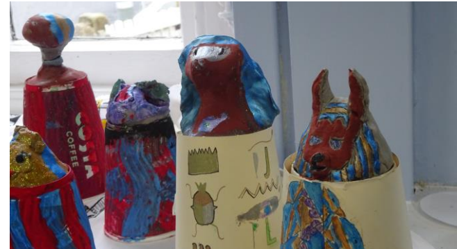
Our Canopic jars

Class 1 have been writing stories about the happy prince which